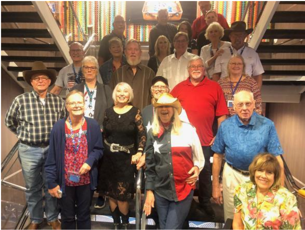
Group Shot of all the Wingers N Waves Folks